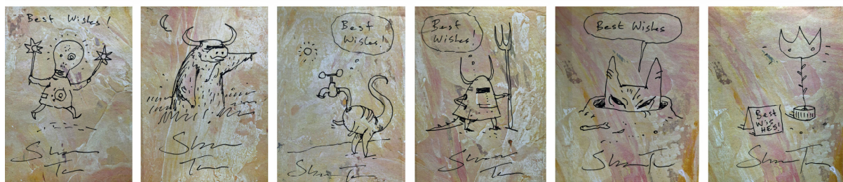
Shaun Tan - hand-drawn bookplates

Shown below are details of six of the hand-drawn book plates by Shaun Tan, each of which is in one of our copies of his recent book Creature [Walker Books, 2022] £35 Order the one you like best!